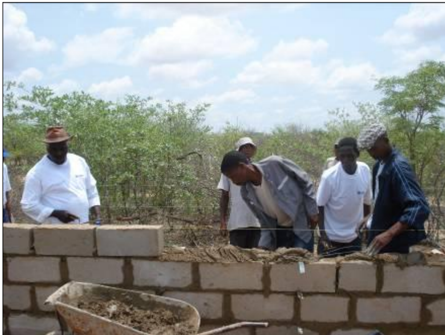
HFHB local volunteers at work

Telephone no: +267 393 2175 or +267 316 5017 Fax no: +267 393 2169 Email: director@hfhbotswana.org.bw Website: www.hfhbotswana.org.bw