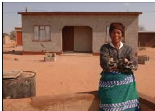
Proud HFHB homeowner (After HFHB)