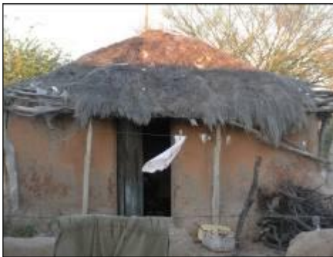
Substandard housing in Botswana (Before receiving HFHB house)

Substandard Housing is generally considered a traditional house made of mud walls and thatch roof, or a poorly constructed brick house. Estimating the annual population growth and using an average household size of 3.56 individuals, 12,000 houses a year are needed to eliminate poverty housing in the country. Sixty-four percent of households in Botswana live in traditional huts (mud/reed walls and thatch or iron roofs); 3% live in non-dwellings.